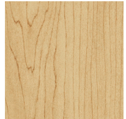
Hard Rock Maple